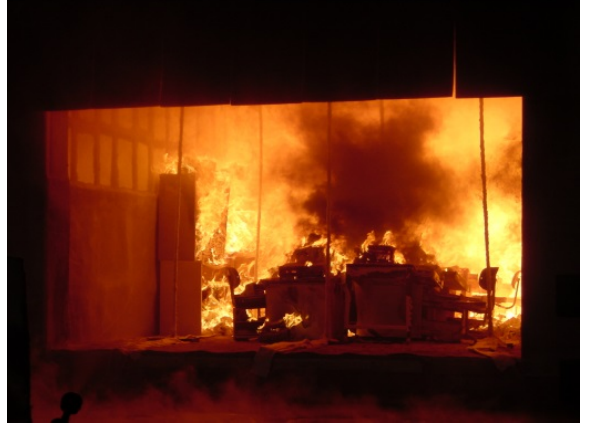
Fire Test on Office Room