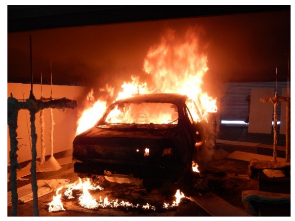
Car Fire Test