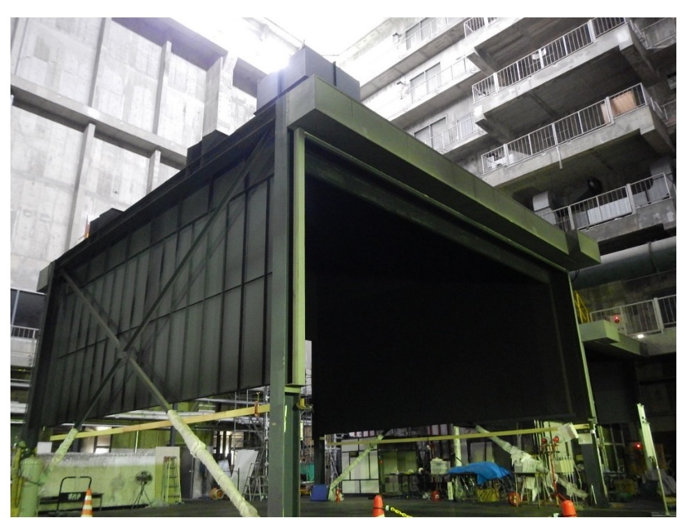
Fire test hall with smoke exhaust hood used for measuring heat, smoke and gas generated from combustion. (7 story smoke control test tower is seen at right rear.)

The laboratory consists of a burn hall with 720m<sup>2</sup> floor area and 27m ceiling height, observation rooms and 7 story smoke control test tower equipped with several burn rooms, two stair-wells, an air supply shaft, smoke exhaust shaft and mechanical fans.