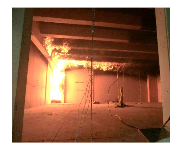
Fire Tests on building materials/products used at interior and/or exterior of buildings