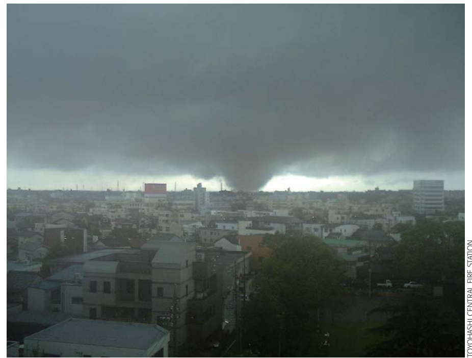
Photo 1. A tornado on the horizon in Toyohashi, Aichi Prefecture, September 24, 1999

causing record-breaking rainstorms in a number of areas. According to data from the Cabinet Office, these typhoons caused great damage, killing 214 people, injuring 2,542, fully destroying or causing more than 50% loss to about 1,200 dwellings, half-destroying or causing 20 –50% loss to another 9,300, and partially destroying or causing less than 20% loss to 67,000. Tornadoes, meanwhile, are violent, rotating columns of air involving an ascending air current, which may occur under a cumulonimbus cloud, for instance. Tornadoes range from tens