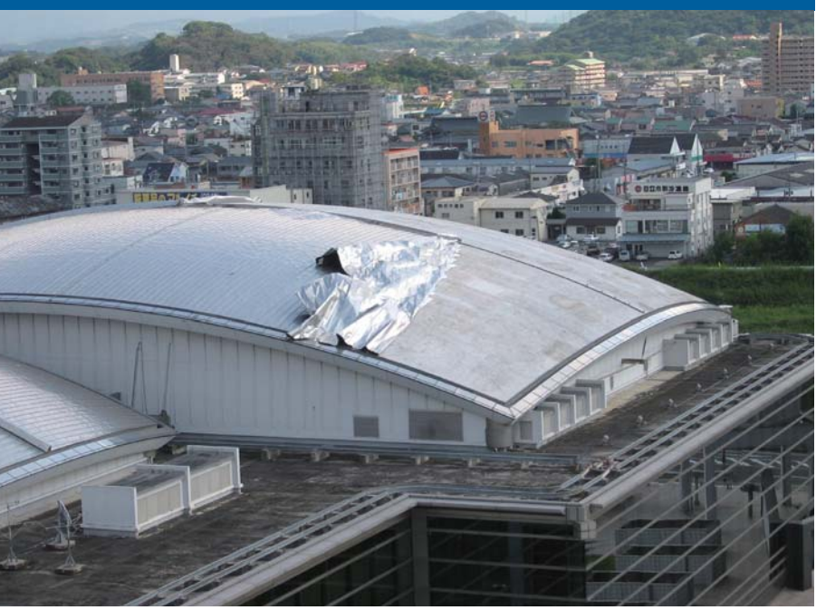
Photo 3. The roof of the lizuka Cosmoscommon in Fukuoka Prefecture damaged by Typhoon Shanshan in September 2006

2) As in the case of Iizuka Cosmoscommon, the roofs of particular buildings may be damaged even when