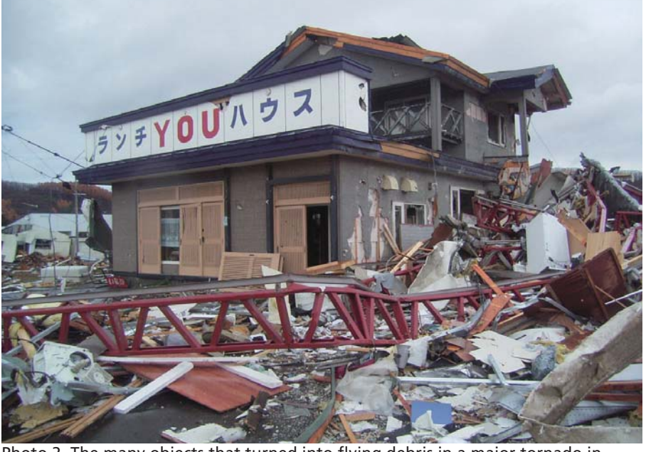
Photo 2. The many objects that turned into flying debris in a major tornado in Hokkaido, November 2006