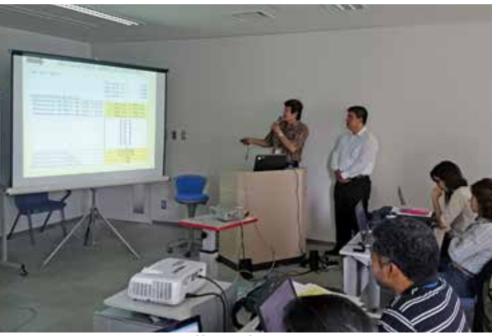
Fourteen engineers and officials from El Salvador, the Dominican Republic, Nicaragua and Peru attended a training program on earthquake-resistant technology in June and July 2014 at the Building Research Institute in Japan.

nology in El Salvador. From June through July of 2014, the Building