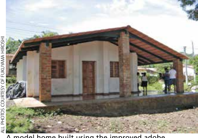
A model home built using the improved adobe construction method